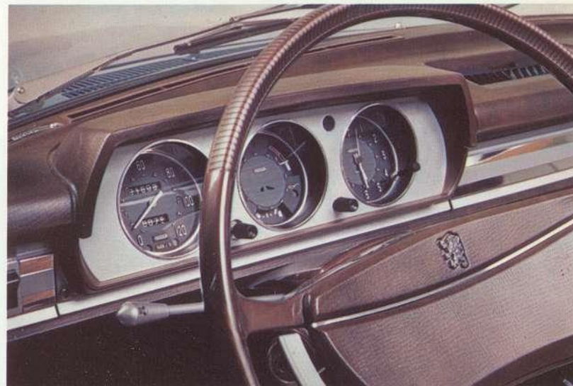
All informative, anti-glare instrument panel includes transistorized electric clock with second hand, trip gauge, voltmeter, choke warning light plus all other standard gauges, meters and warning lights.