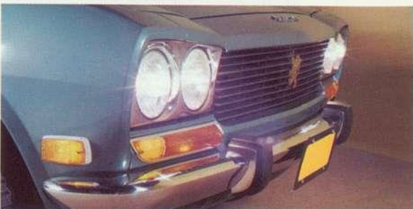
Peugeot 504 Station Wagon, styled by Pininfarina.