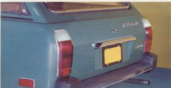
Over-sized, heavy-duty rear bumper guards. De-froster clears rear window quickly.