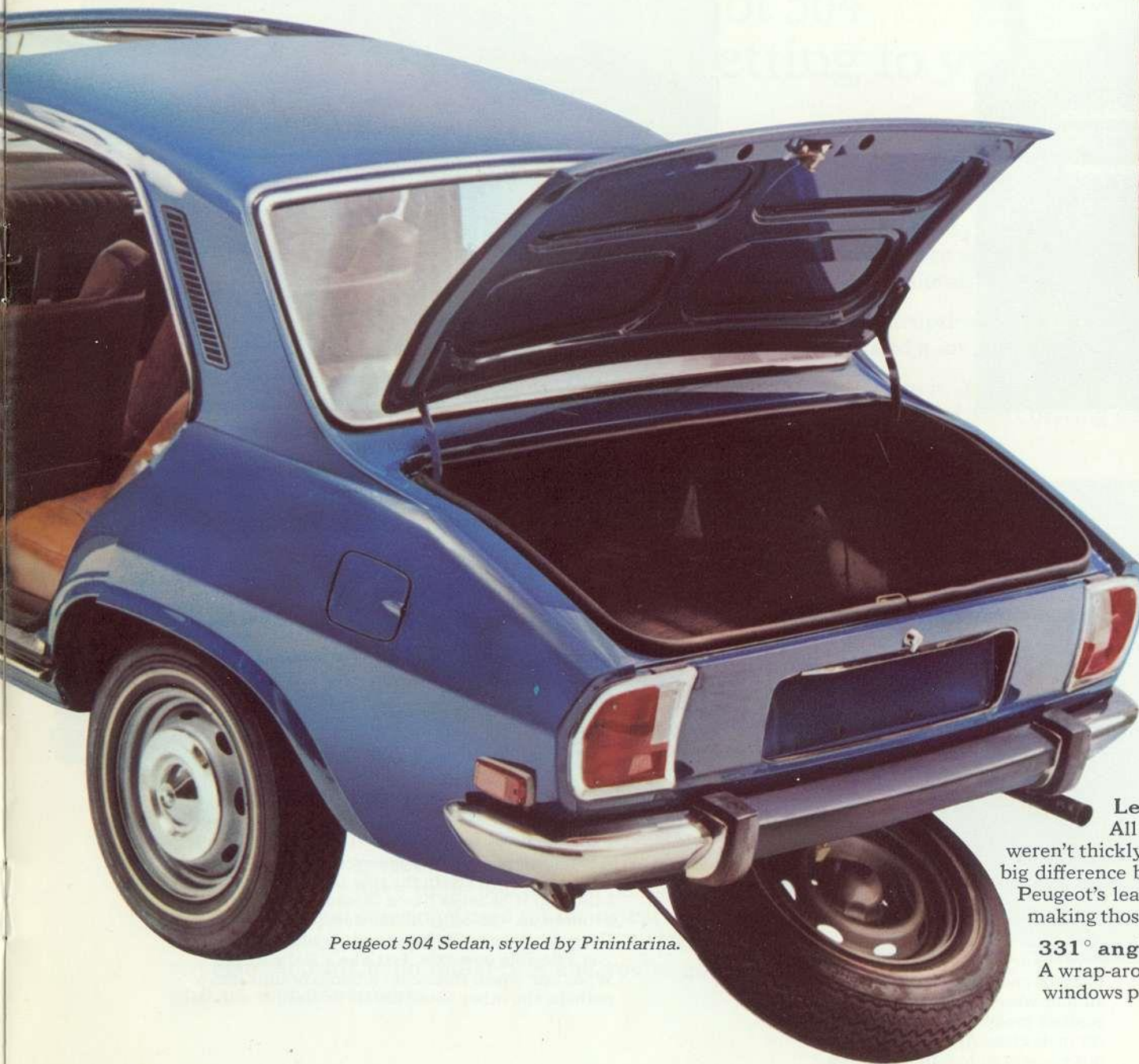
Peugeot 504 Sedan, styled by Pininfarina.