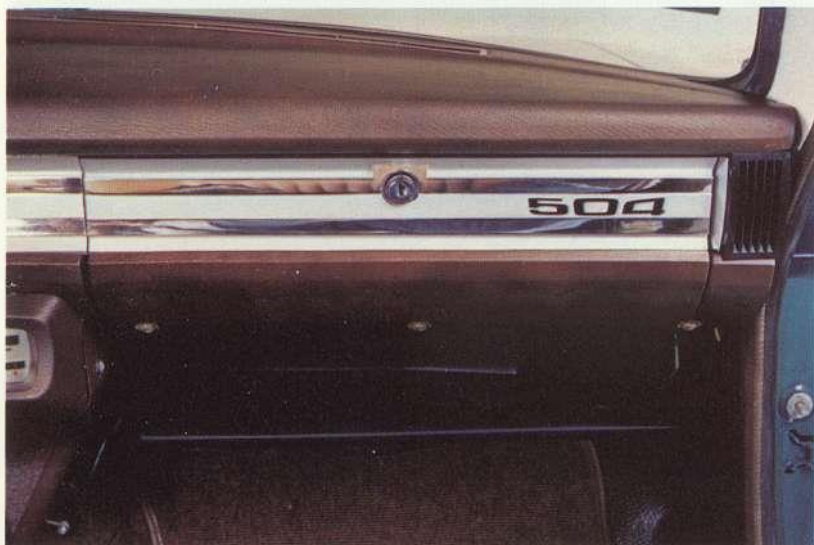
Lockable glove box compartment and handy parcel shelf underneath