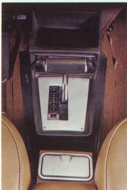
Optional ZF automatic transmission (Standard transmission stick shift is floor mounted)