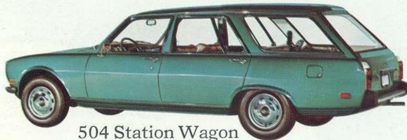
504 Station Wagon