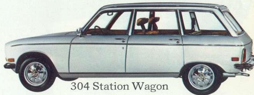
304 Station Wagon