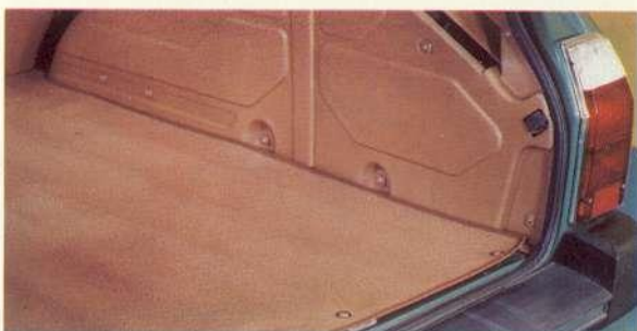
Multiple coil springs on the rear wheels help keep baggage from bouncing around.

The new Peugeot 504 Station Wagon. Look at it. Touch it. Sit in it. Open the hood. Lift the tailgate. But most important, test drive it. By yourself, and with the whole family along.