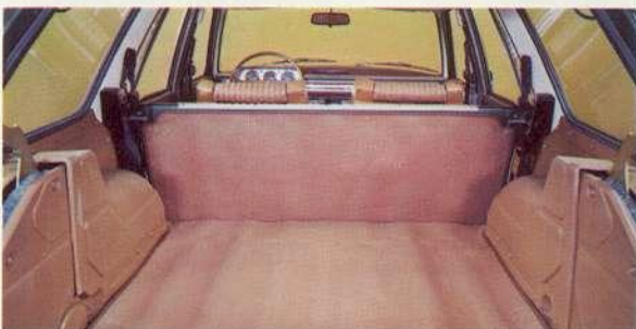
Total baggage area: 66 cu. ft. Tailgate hinged at top for easy loading.