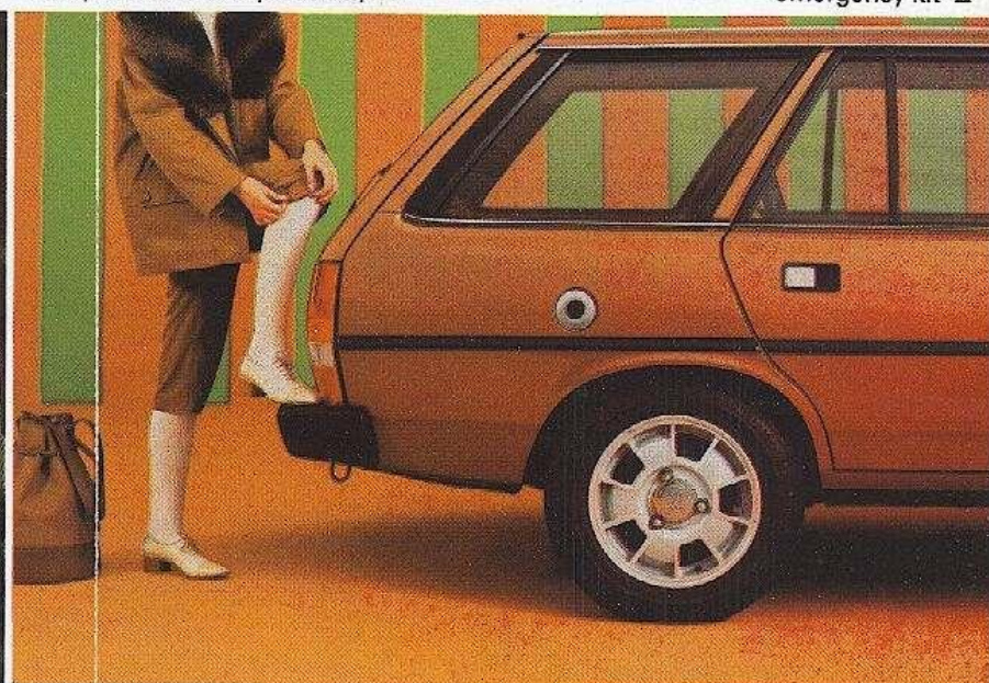
alloy wheels ▼ ▼ weathershield - roof rack