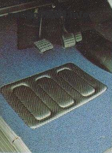
▲ floor mats ▲