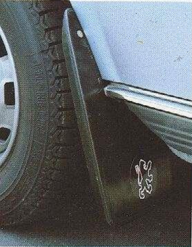
mud flap ▲