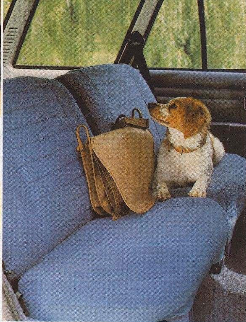
seat cover ▲