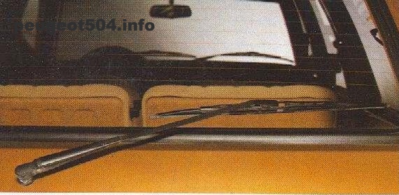
rear wash/wiper ▲