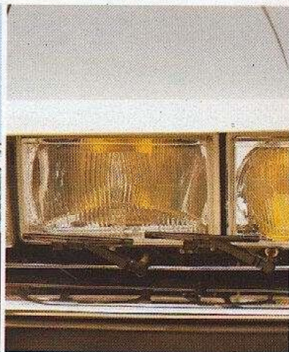
auxiliary lamps ▼