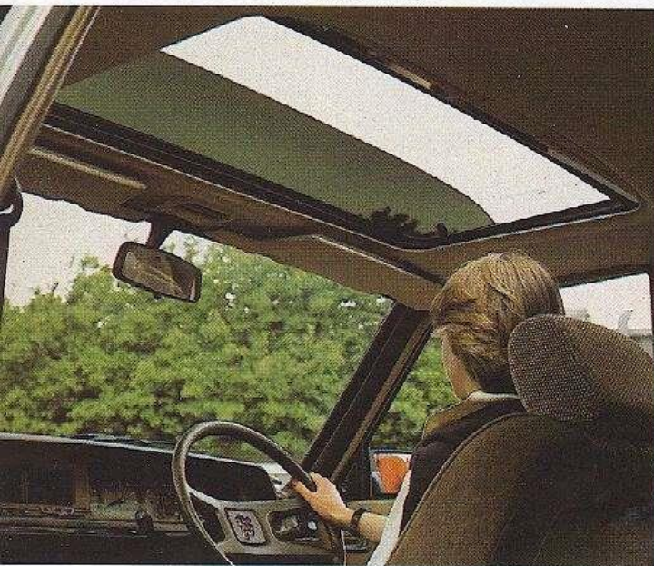
▲ sun roof deflector