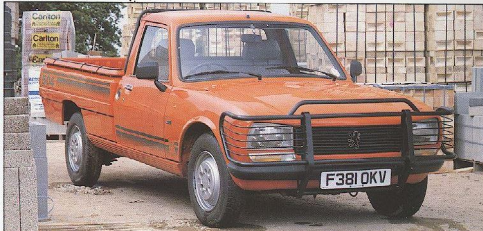
Front nudge bar and side tapes.