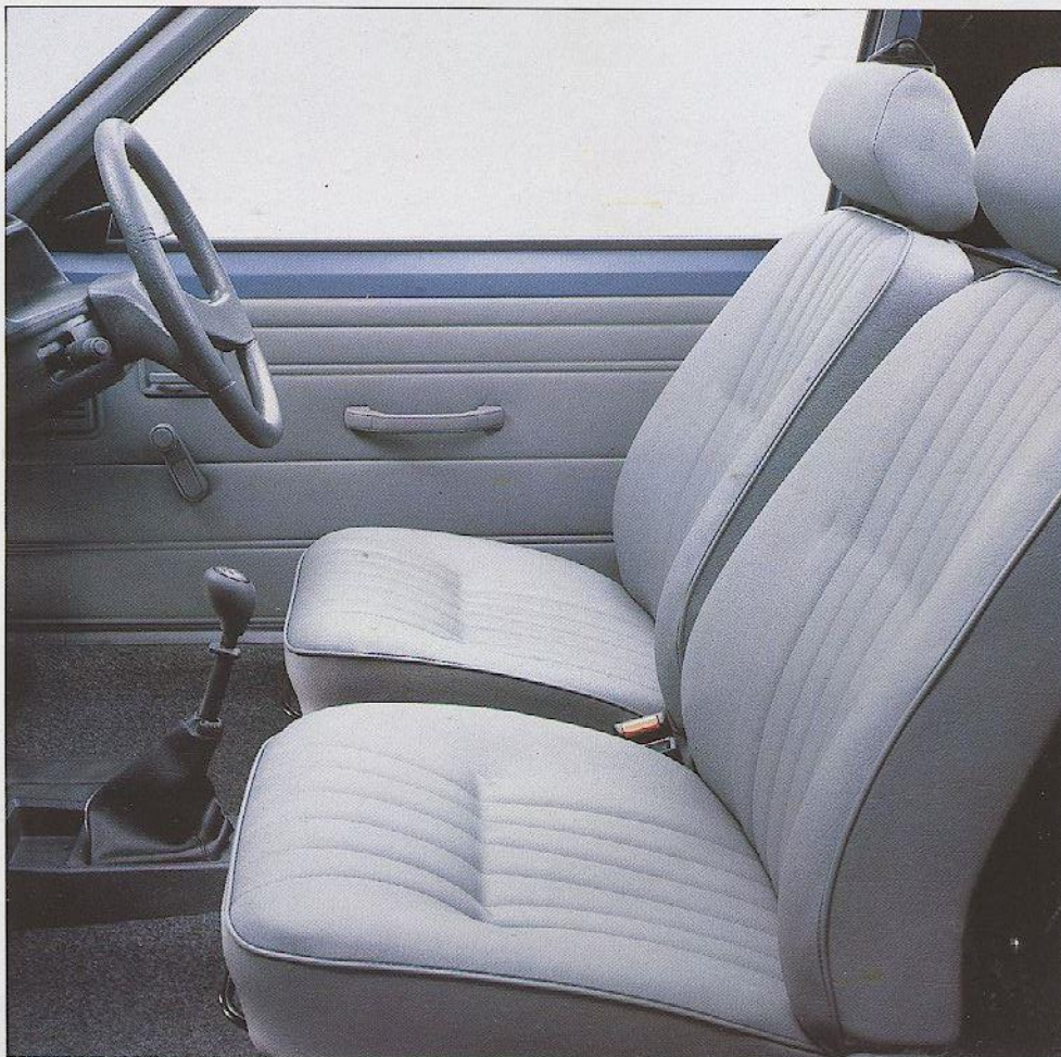
205 Standard Cab

Combining the style and comfort of a small passenger car with a practical 42.4 cu.ft of load space, the Peugeot 205 Van gives you the best of both worlds with front wheel drive maximising the usable interior space and giving first class handling.