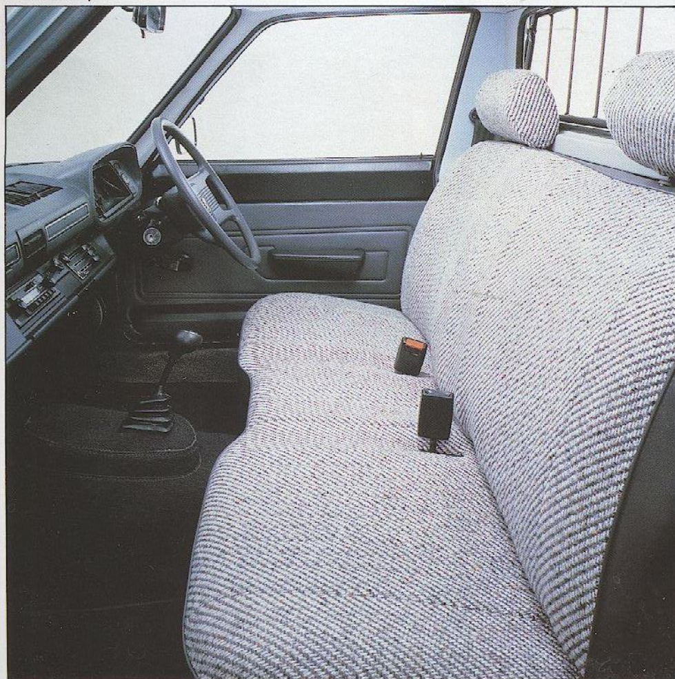
504 GL Cab

The Standard and GL versions of the 504 Pick-Up make very practical business sense.