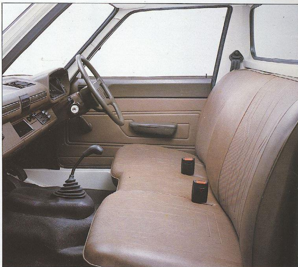
504 Standard Cab

Available as an accessory is a GRP hardtop, giving additional load security with the load capacity of a big van. Check out the features, try it for size, the 504 will measure up to your needs.