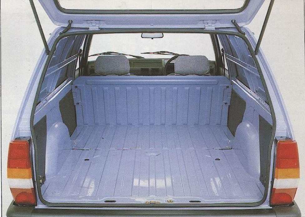
305 GL Van

available as a special order option. A seat height load retaining bulkhead is fitted behind the seats for additional safety. The attractively styled fascia incorporates comprehensive and clear instrumentation. Ample stowage facilities in the cab include door pockets and a glovebox with lid. Standard equipment includes a radio cassette with twin speakers, manual remote control door mirrors, cab floor carpet, tailgate wash/wipe, heated rear window, halogen headlamps and a laminated windscreen. All Peugeot 305 Vans benefit from a 6-year supplementary anti-perforation warranty which is transferable on change of ownership. See your Peugeot Talbot dealer for full details and conditions of this warranty.