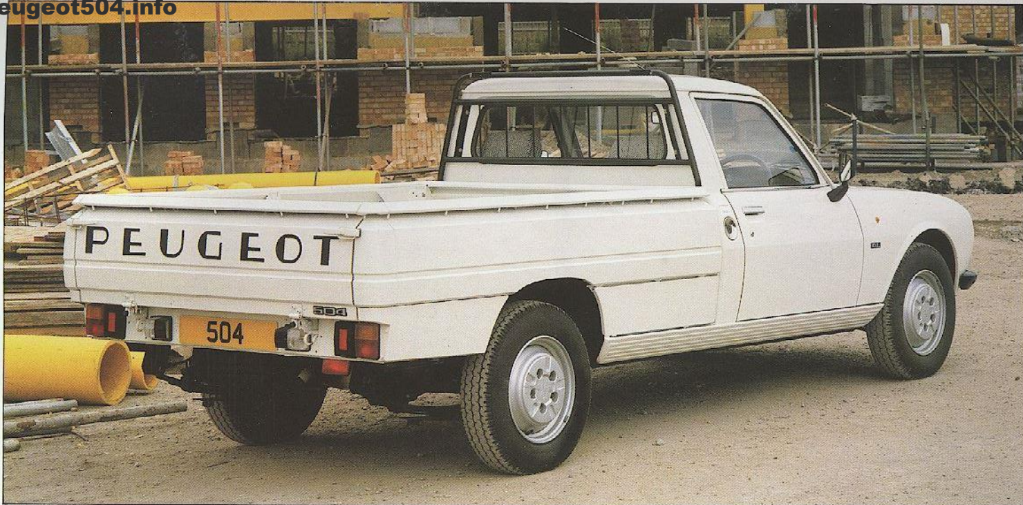
504 GL Pick-Up

clear, easy to read instruments including a clock. A lockable glovebox and door pockets provide useful stowage facilities in the cab and the efficient heating and ventilation system has the benefit of a variable speed blower.