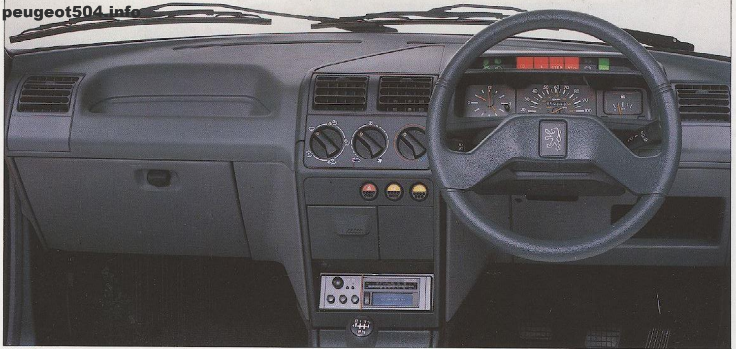
205 GL Fascia

standing headroom underneath. Load adjustable halogen headlamps, heated rear window, laminated windscreen and a lockable fuel filler cap are also standard equipment.