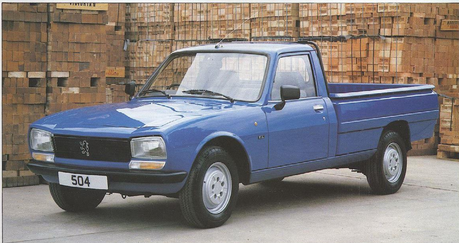
504 GL Pick-Up