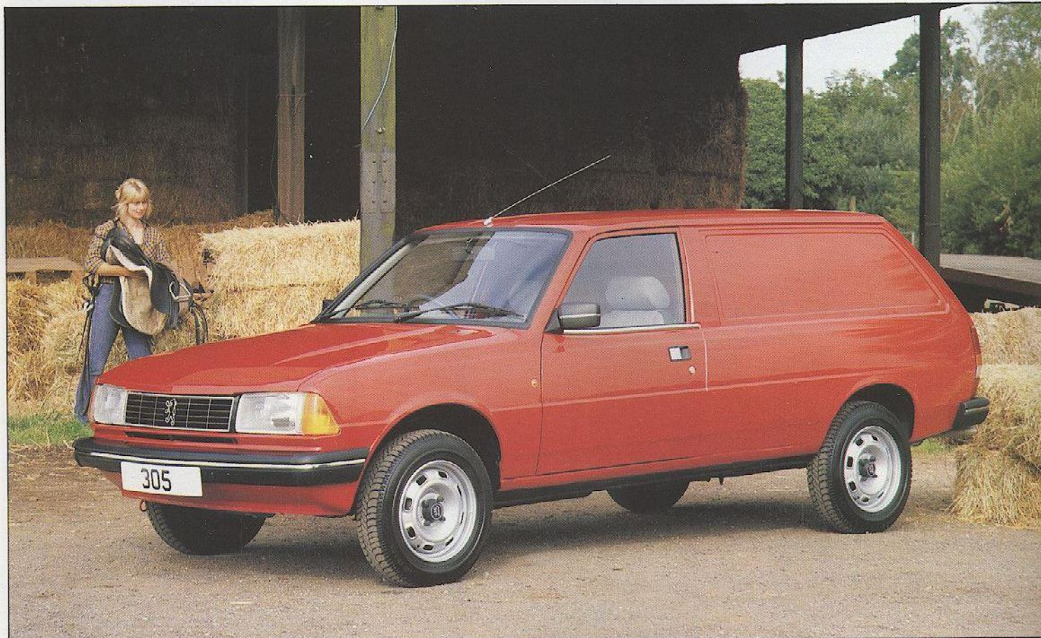
305 GL Van

The superbly equipped Peugeot 305 GL Van offers a combination of saloon car comfort and practical load carrying qualities.