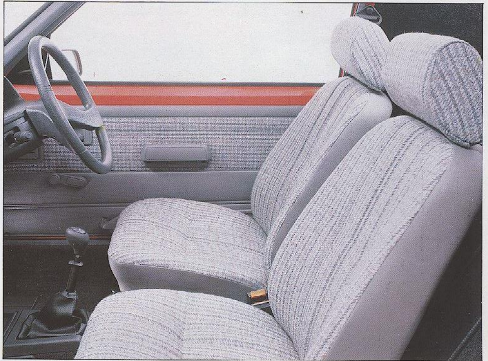
205 GL Cab

The 205 Van is built to last, having a 6-year supplementary anti-perforation warranty following the 9-stage protective treatment applied during manufacture. Ask your Peugeot Talbot dealer for full details.