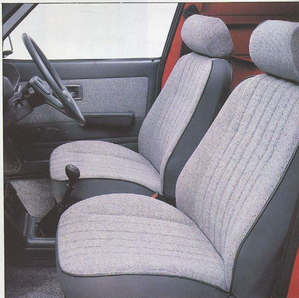
305 GL Cab

Driver's and passenger's seats are trimmed in attractive grey cloth with padded head restraints and are adjustable for rake. Textured vinyl seats are