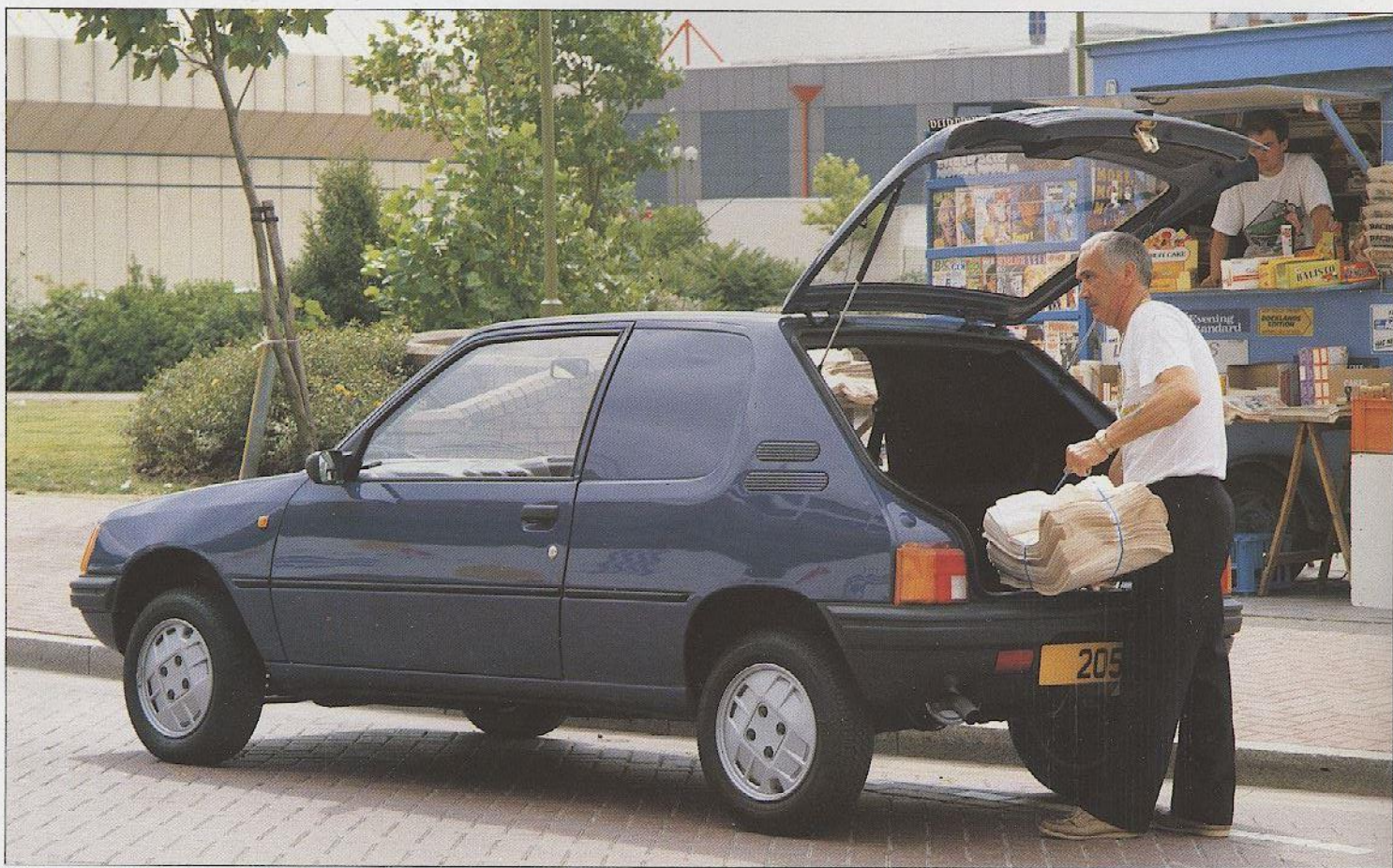
205 Standard Van