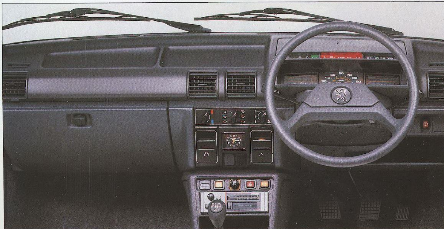
305 GL Van