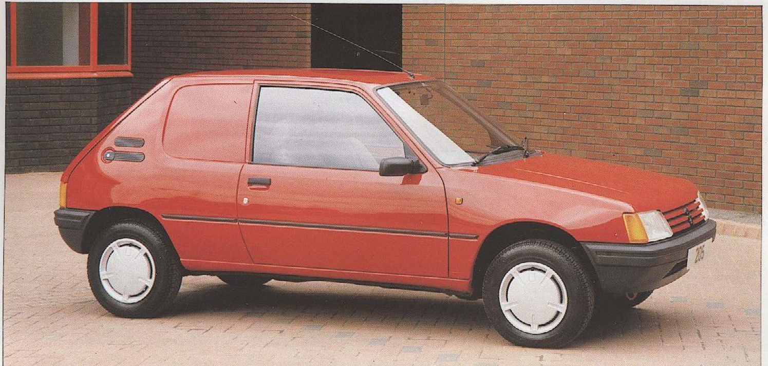
205 GL Van