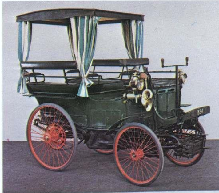
The world's first station wagon. The Peugeot Ranch Wagon of 1894.

After all, you don't get to be the second oldest carmaker in the world, by making second-rate cars.