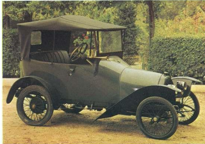
The world's first compact car, the popular Bébè Peugeot of 1911.