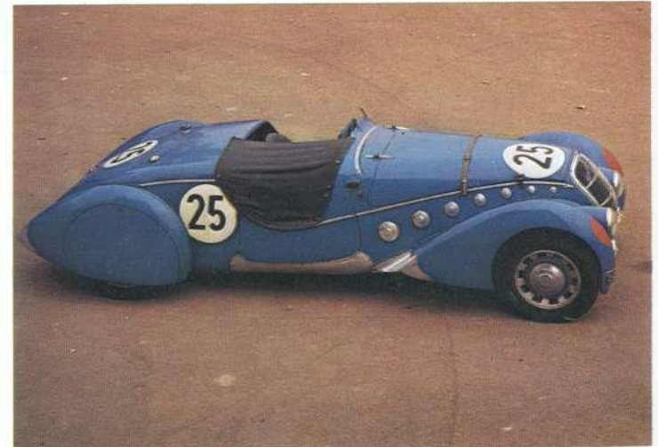
The 1938 Peugeot Delemon.