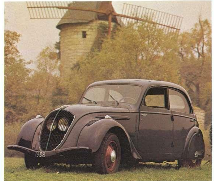
The aerodynamic Type 202 of 1938.