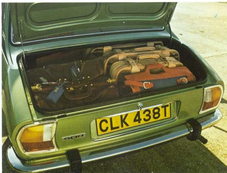
There is a cavernous boot for all your luggage. The spare wheel is stowed underneath the car to leave the load area completely free.