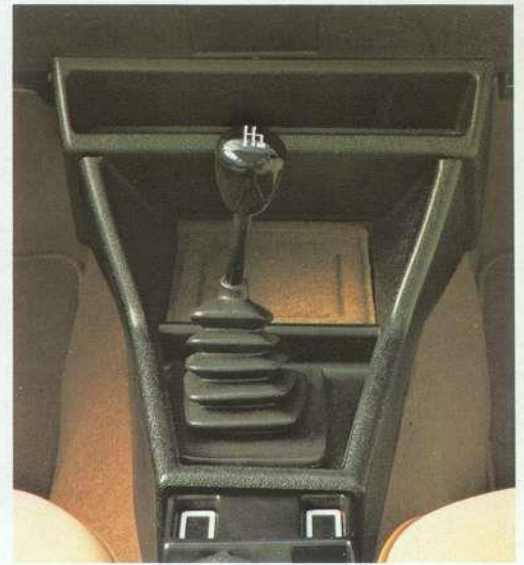
A new, short gear stick to enable easy, smooth gear changes.