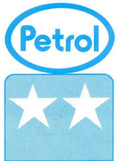
The 504 runs on 2 star petrol, giving up to 36 mpg, or choose the Diesel engine option, returning 41.5 mpg at a constant 56 mph. (see fuel consumption table for full details).