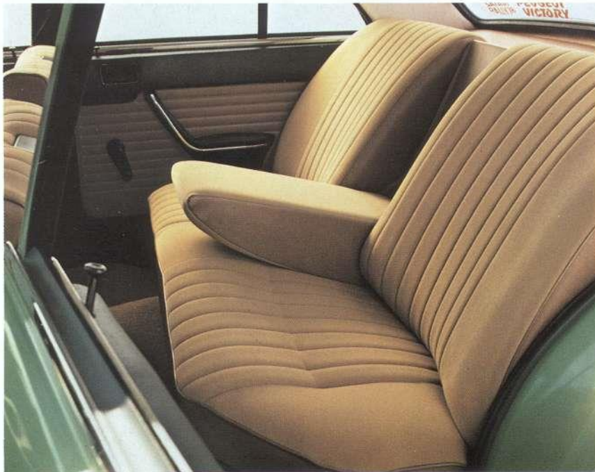
Deep comfortable cloth covered seats. With a fold-down centre armrest in the rear seat to give your passengers total relaxation.