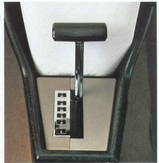
Automatic transmission is available as an option.